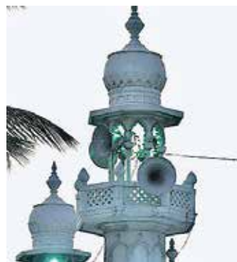
Loudspeakers atop a mosque. ▪ PICTURE FOR REPRESENTATION

In tandem with Nashik Police's order, Maharashtra Home Minister Dilip Walse-Patil said the State Director General of Police and the Mumbai Police Commissioner have been directed to prepare guidelines on the use of loudspeakers. He said a notification for the entire State