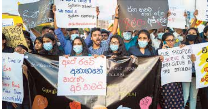
Protesters shout slogans demanding President Gotabaya Rajapaksa's resignation over the country's crippling economic crisis.

The origins of the linguistic disenfranchisement of the Tamils owed partly to the appeasement of the Buddhist clergy, which is almost exclusively Sinhala. It not only caused the alienation of the Tamil-speaking population but led to the formation of the Tamil Tigers, a terrorist organisation, and a civil war. The Tamil Tigers were finally vanquished, but it took over two-and-a-half decades for the Sri Lankan state to achieve this. In the meanwhile, there was an exodus of Tamils, the better-off leaving for the West and, those who could escape, heading for Tamil Nadu.