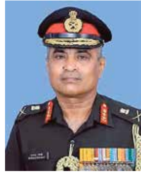
Lt. Gen. Manoj Pande